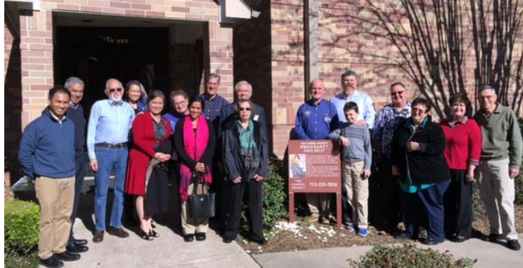
Knights and family members attend 5th Sunday rosary at St. Laurence Church