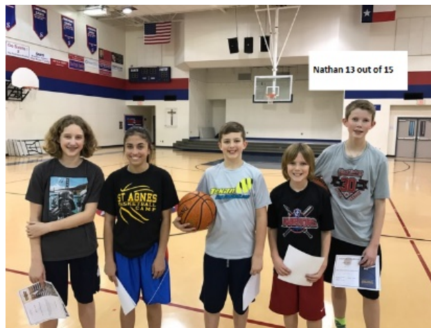
Contestants of the annual Knights' Free Throw contest held at St. Laurence School gym