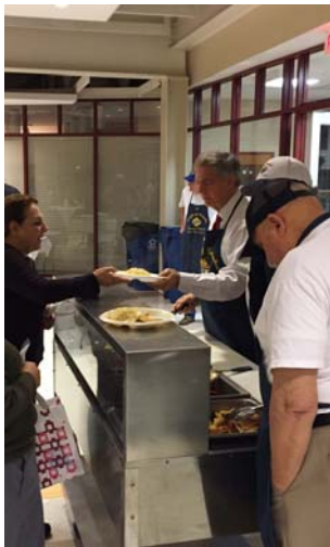
Parish spaghetti dinner provided by Council members