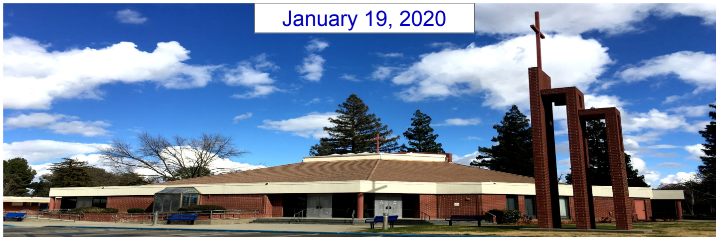
Photograph of St. John the Evangelist Catholic Church