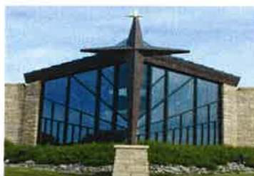
1. c. St. Peter

To register as a parishioner at IHM, please stop by the Parish Office.