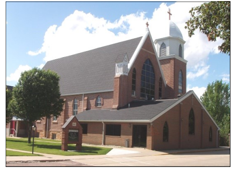
St. James Catholic Church 109 6th Ave. SW