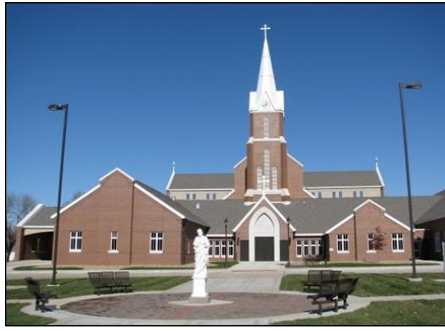
St. Joseph Catholic Church 605 Plymouth St. NE