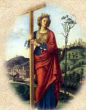
Saint Helen, Pray for us

Jesus said to his disciples: 'If you love me you will keep my commandments. I shall ask the Father, and he will give you another Advocate to be with you for ever, that Spirit of truth whom the world can never receive since it neither sees nor knows him; but you know him, because he is with you, he is in you. I will not leave you orphans; I will come back to you. In a short time the world will no longer see me; but you will see me, because I live and you will live. On that day you will understand that I am in my Father and you in me and I in you. Anybody who receives my commandments and keeps them will be one who loves me; and anybody who loves me will be loved by my Father, and I shall love him and show myself to him.'