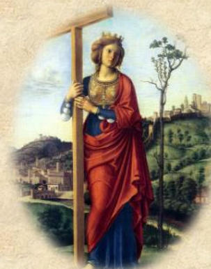
Saint Helen, Pray for us