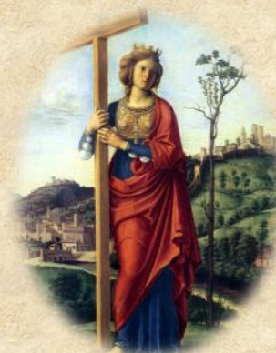
Saint Helen, Pray for us

Jesus began to make it clear to his disciples that he was destined to go to Jerusalem and suffer grievously at the hands of the elders and chief priests and scribes, to be put to death and to be raised up on the third day. Then, taking him aside, Peter started to remonstrate with him. 'Heaven preserve you, Lord;' he said 'this must not happen to you.' But he turned and said to Peter, 'Get behind me, Satan! You are an obstacle in my path, because the way you think is not God's way but man's.' Then Jesus said to his disciples, 'If anyone wants to be a follower of mine, let him renounce himself and take up his cross and follow me. For anyone who wants to save his life will lose it; but anyone who loses his life for my sake will find it. What, then, will a man gain if he wins the whole world and ruins his life? Or what has a man to offer in exchange for his life? 'For the Son of Man is going to come in the glory of his Father with his angels, and, when he does, he will reward each one according to his behaviour.'