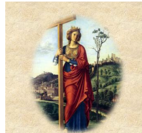
Saint Helen, Pray for us

Jesus said to the chief priests and the elders of the people, 'Listen to another parable. There was a man, a landowner, who planted a vineyard; he fenced it round, dug a winepress in it and built a tower; then he leased it to tenants and went abroad. When vintage time drew near he sent his servants to the tenants to collect his produce. But the tenants seized his servants, thrashed one, killed another and stoned a third. Next he sent some more servants, this time a larger number, and they dealt with them in the same way. Finally he sent his son to them. "They will respect my son" he said. But when the tenants saw the son, they said to each other, "This is the heir. Come on, let us kill him and take over his inheritance." So they seized him and threw him out of the vineyard and killed him. Now when the owner of the vineyard comes, what will he do to those tenants?' They answered, 'He will bring those wretches to a wretched end and lease the vineyard to other tenants who will deliver the produce to him when the season arrives.' Jesus said to them, 'Have you never read in the scriptures: It was the stone rejected by the builders that became the keystone. This was the Lord's doing and it is wonderful to see? 'I tell you, then, that the kingdom of God will be taken from you and given to a people who will produce its fruit.'