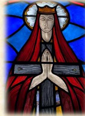
Saint Helen, Pray for us

Some Pharisees approached Jesus and asked, 'Is it against the law for a man to divorce his wife?' They were testing him. He answered them, 'What did Moses command you?' 'Moses allowed us' they said 'to draw up a writ of dismissal and so to divorce.' Then Jesus said to them, 'It was because you were so unteachable that he wrote this commandment for you. But from the beginning of creation God made them male and female. This is why a man must leave father and mother, and the two become one body. They are no longer two, therefore, but one body. So then, what God has united, man must not divide.' Back in the house the disciples questioned him again about this, and he said to them, 'The man who divorces his wife and marries another is guilty of adultery against her. And if a woman divorces her husband and marries another she is guilty of adultery too.'