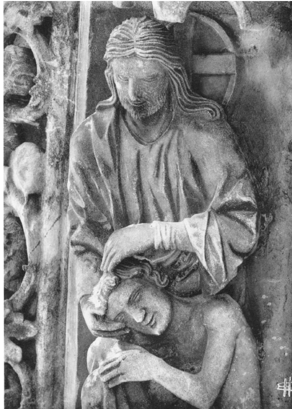
Statue of Christ and St. John on the exterior of the Cathedral of Chartres, France, dating from the 15th century

An interesting special feature of this whole process is the Church's appointment of a competent person called the Promoter of the Faith (in earlier times, this person was called the "Devil's Advocate"), whose only duty is to present obstacles to the cause by questioning aspects of the candidate's life that might disprove his or her practice of saintly virtue, and the orthodoxy of his or her writings and other available pronouncements. The Promoter of