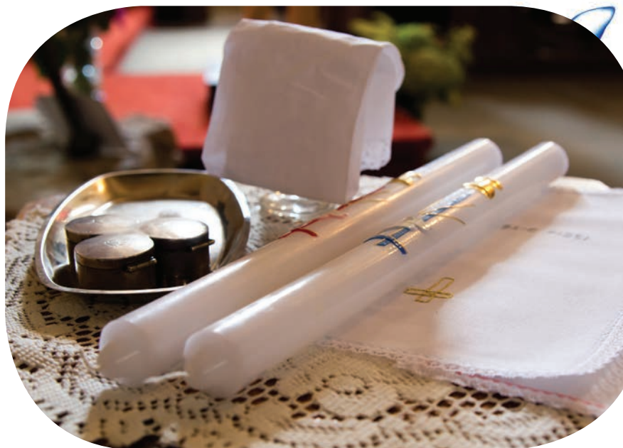
Sacramentals for infant Baptism in the Church