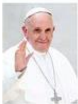
Pope Francis said: