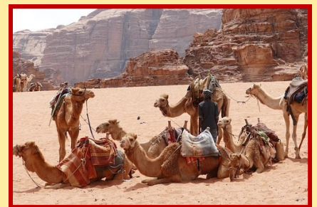
Wadi Rum, Jordan