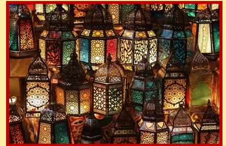
Street Shop Lamps