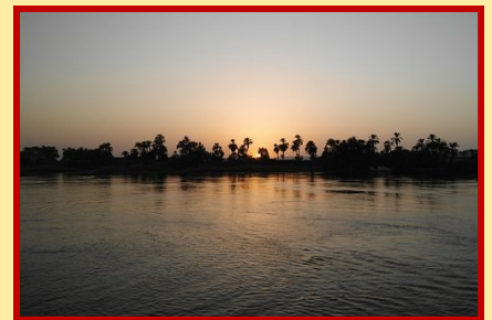
Nile River, Egypt