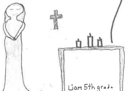
Artist - Liam Nordick - 5th Grade

People who sit in darkness see great light.