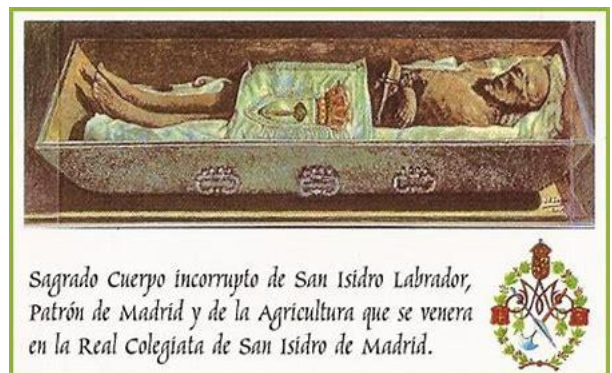
Sagrado Cuerpo incorrupto de San Isidro Labrador, Patrón de Madrid y de la Agricultura que se venera en la Real Colegiata de San Isidro de Madrid.