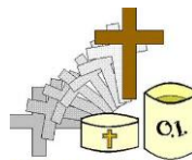
Sacrament of Anointing