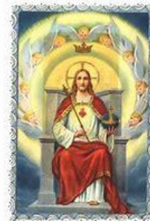
Christ, our King