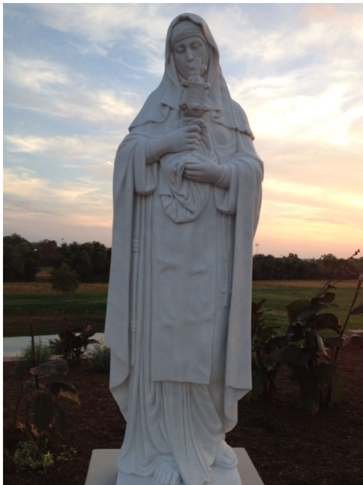
St. Clare of Assisi, Pray for Us!