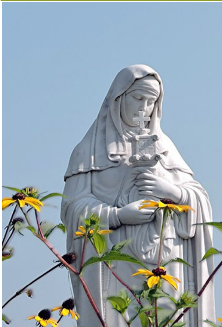
Saint Clare of Assisi, Pray for Us!