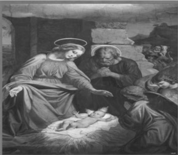
THE NATIVITY of the Lord "For today in the city of David a savior has been born for you who is Christ and Lord." (Lk 2:11) Escaped from the Labyrinth for Mass 8/20/11 1PM, 1979 CDS