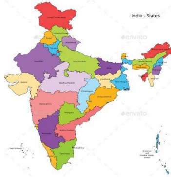
India with Andhra Pradesh map