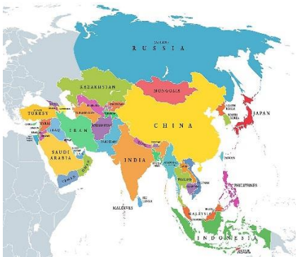
Asia with India map

2. Motorbikes for the Catholic Priests: Kurnool Catholic Diocese comprises of two civil districts (Kurnool and Anantapur) with 92,500 Catholics in 60 rural parishes and 300 missions spread in 17000 square miles. At present there are 30 seminarians, 120 priests, 350 religious sisters and 300 rural catechists serving the spiritual needs of the faithful.