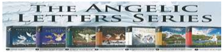
Sold in Holy Grounds & Gifts!

"Like" us on Facebook! Knights of Columbus Council #9642