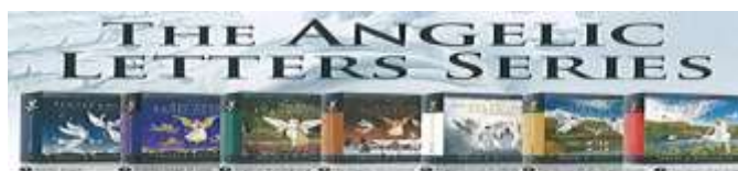
Sold in Holy Grounds & Gifts!

Due to continuing COVID concerns, there will NOT be VBS this summer.