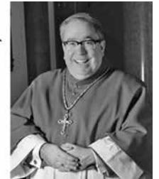
Bishop's Annual Appeal