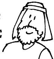
James, son of Alphaeus