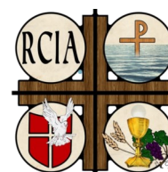
Rite of Christian Initiation for Adults

Registration for the Rite of Christian Initiation of adults and adapted for children 7yrs and older is going on now. Please call the Parish office for an application or email reli-gioused@stmarystarofthesea.org .