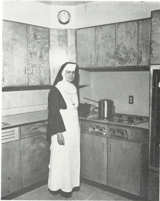
The convent kitchen is complete in every detail with two built-in ovens, spacious cabinets and modern facilities.

At the present time the following Sisters are teaching here at St. Francis De Sales grade school and Central Catholic High School: