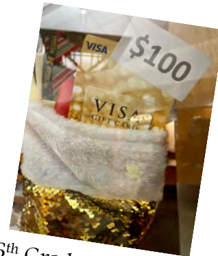
6th Grade – 8th Grade $100 VISA Gift Card

(1) Grand Prize Winner from each School Wing will be picked on Friday, December 18th .