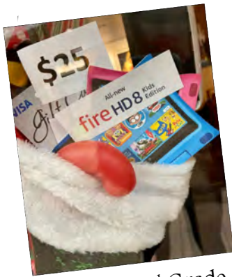
Pre K – 2nd Grade Kindle Fire HD 8 & $25 Gift Card