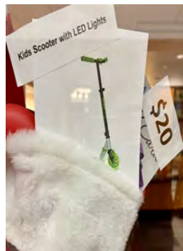
3rd Grade – 5th Grade Scooter with LED Lights & $20 Gift Card