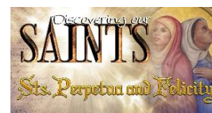
Pray for us