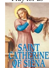
Pray for us