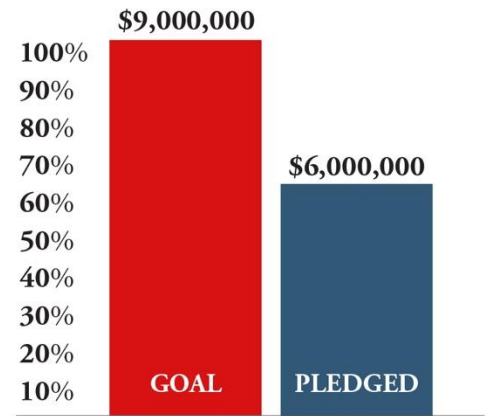
Pledged as of April 2021

Your gift will truly make a difference. Thank you for your prayers and support.