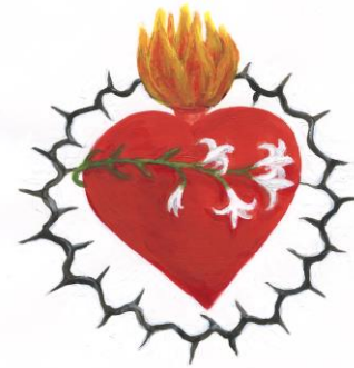
Immaculate Heart of Mary

The promise of the Triumph of Mary’s Immaculate Heart is hope for a broken and sinful world. In this Triumph, we will love God and our neighbor (cf. Mt 22:37-39), evil will lose its power, and there will be peace.