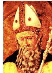
St. Polycarp, February 23