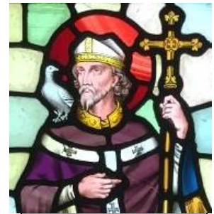
Saint David - March 1