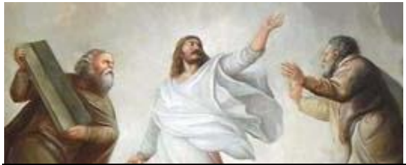
Titian's The Transfiguration , San Salvador Church, Venice.

One of the great values of Lent and other seasons of suffering is how they illuminate the present moment. When the disciples want to make camp on the mountaintop, Jesus doesn't know what to say to them knowing that they were frightened. Following this, a voice from the cloud said, 'This is my Son, the Beloved; listen to him.' When God calls to Abraham, the response is, "Here I am." Listening to God's call is an essential discipline. We need not fear or worry about whether we like or dislike what God is asking. We need to be attentive to God's call and respond as Abraham did. God is faithful, and we have this present moment to respond.