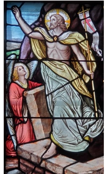
Stained glass panel, St. Patrick, Fallowfield

In a special way, Christ stays with us in the daily offering of the holy Eucharist. That is why the Mass is the center and source of Christian life. In each and every Mass the complete Christ, head and body, is present. For Christ is the way; he is the mediator; in him we find everything. Outside of him our life is empty. In Jesus Christ, and taught by him, "we dare to say: Our Father." We dare to call the Lord of heaven and earth our Father. The presence of the living Christ in the host is the guarantee, the source and the culmination of his presence in the world. Excerpted from "Christ's Presence in Christians," an excerpt from the homily given by St. Josemaria Escriva on Easter Sunday, March 26th, 1967.