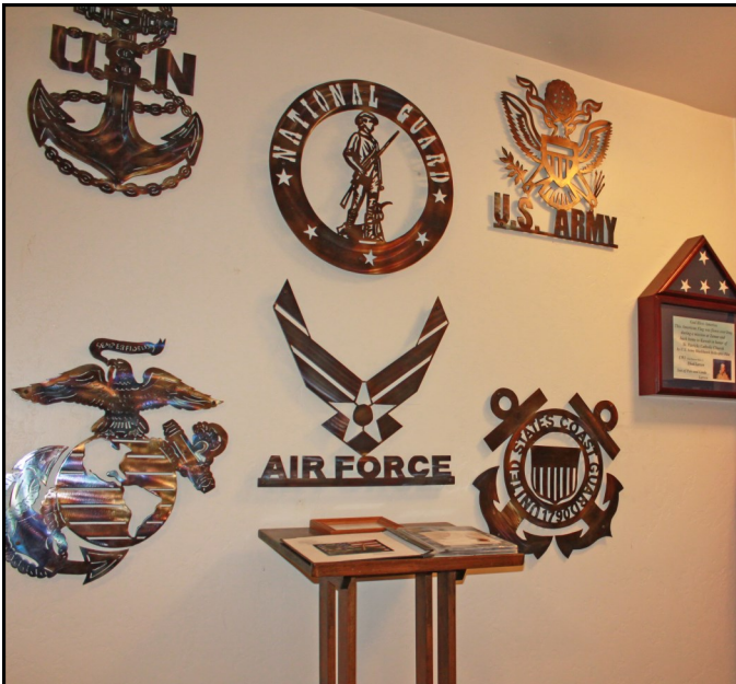
The emblems of the military services on display on the south wall of the vestibule of St. Patrick Church are, from left to right and top to bottom, Navy, National Guard, Army, Marine Corps, Air Force and Coast Guard. See page 2 for an article on the framed flag and certificate (seen to the right of the emblems).

In a letter to George Opdyke, mayor of New York City during the Civil War, Abraham Lincoln wrote, "Honor to the soldier and sailor everywhere who bravely bears his country's cause. Honor also to the citizen who cares for his brother in the field and serves, as best he can, the same cause."