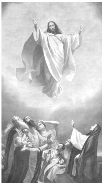
Image: Kath. Pfarrkirche St. Johannes Baptist, Obereschach, Stadt Ravensburg Fresken von Gebhard Fugel, 1893/1894

If you want to grow in your faith and avoid losing it, then you must study your faith. One suggestion: read, study, and learn the Catechism of the Catholic Church.