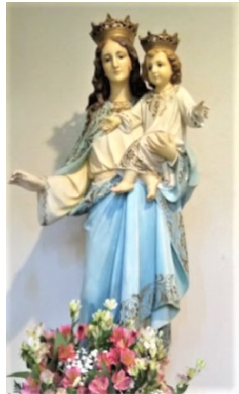
Mary Queen of Heaven and the Child Jesus