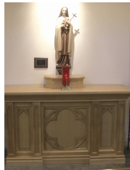
Saint Therese of Lisieux