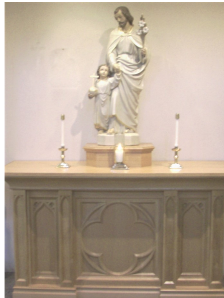
Saint Joseph and the Child Jesus