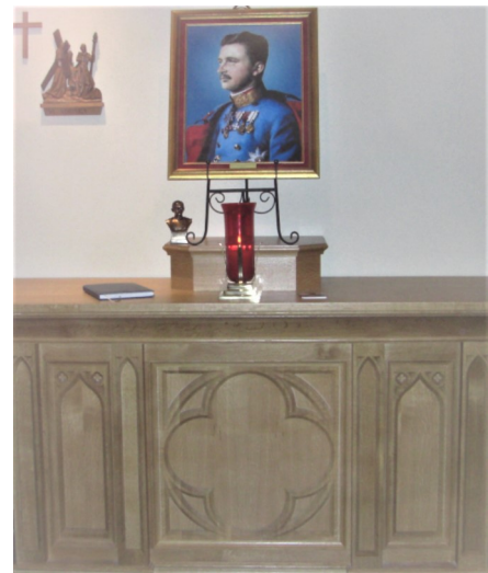
Blessed Charles I of Austria