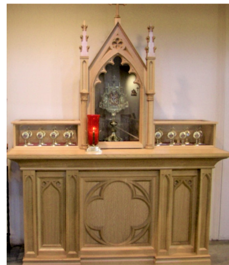
Relics of the True Cross and 17 Saints