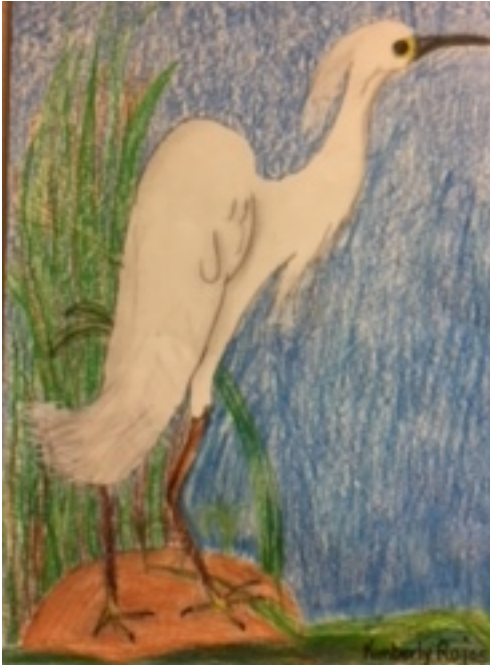
RCS Student Artwork 2017-18