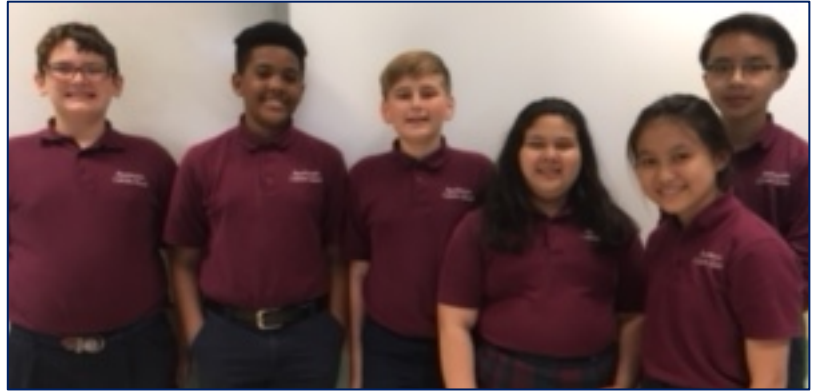
RCSPress Reporters, 2017-18