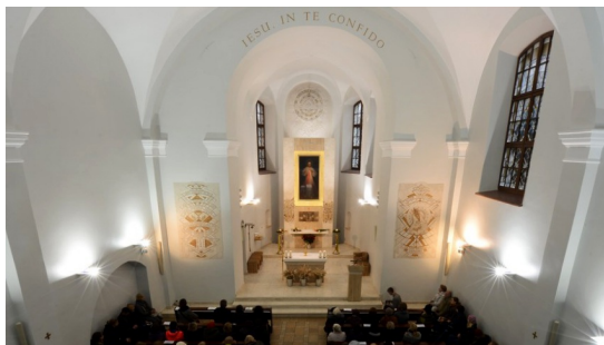
SANCTUARY OF DIVINE MERCY Vilnius, Lithuania

The following are excerpts from Misericors et Miserator [Lt., Merciful and Compassionate ], the formal decree issued May 5, 2000 by the Congregation for Divine Worship and the Discipline of the Sacraments which established the Second Sunday of Easter as "Divine Mercy Sunday".