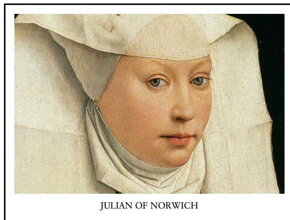
JULIAN OF NORWICH

The first excerpt below is from Pope Benedict XVI's General Audience of 1 Dec 2010. The second is from Julian of Norwich's (d. 1430) Revelations of Divine Love . Julian's account of her visions was the first book written by a woman to be published in England.