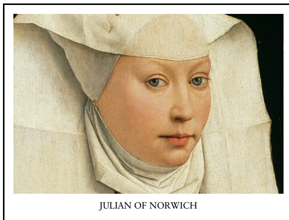
JULIAN OF NORWICH

The first excerpt below is from Pope Benedict XVI's General Audience of 1 Dec 2010. The second is from Julian of Norwich's (d. 1430) Revelations of Divine Love . Julian's account of her visions was the first book written by a woman to be published in England.