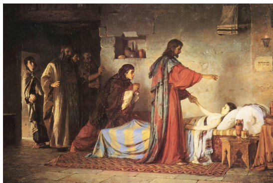
RESURRECTION OF JAIRUS' DAUGHTER by Vasily Polenov (d. 1927)

The first excerpt below is from St Catherine of Siena's (d. 1380) dialogue On Divine Providence . The second is from St Augustine's (d. 430) autobiography entitled Confessions . Faith is necessary for salvation, and it is a gift of God. As St Augustine says, "You called, you shouted, and you broke through my deafness; you flashed, you shone, and you dispelled my blindness." God's purpose and faith's goal? As St Catherine said: "I tasted and I saw ... you could give me no greater gift than the gift of yourself."