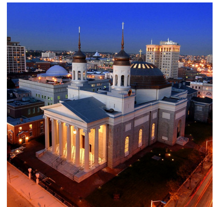
BASILICA OF THE ASSUMPTION Baltimore, MD

Against Heresies], the saint addresses the importance of apostolic succession and traces the succession of the