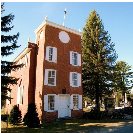
SAINT MARY'S in Claremont was built in 1823. It was the first Catholic Church in New Hampshire.