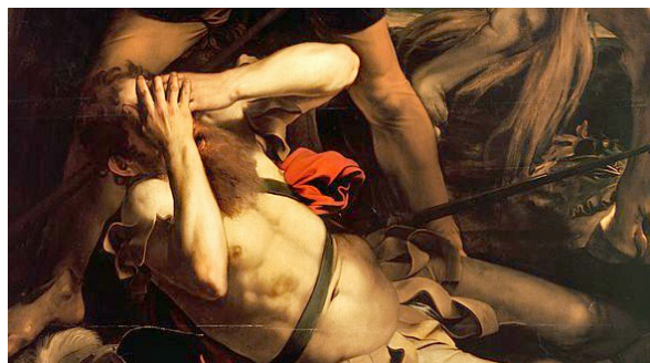
CONVERSION OF SAINT PAUL [detail] by Caravaggio (d. 1610)