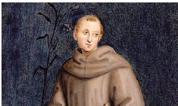
SAINT ANTHONY OF PADUA [detail] by Raphael (d. 1520)

While we have numerous outlines of homilies delivered by St Anthony of Padua (d. 1231), we have only one sermon recorded as it was actually delivered by the Saint. The exact date/occasion is uncertain, but we do know it was addressed to the monks of the Abbey of St Martin [Limoges, France] ca. 1226. It is a reflection on the beauty of the monastic vocation, a call by God to leave the world and to live entirely for Him. Scripture references added.