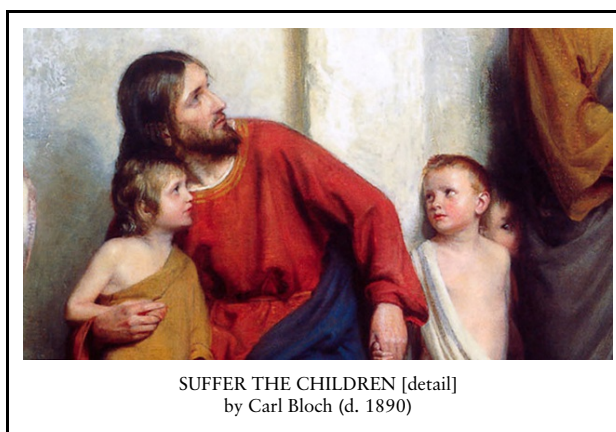
SUFFER THE CHILDREN [detail] by Carl Bloch (d. 1890)

Raising children in the faith is a fundamental responsibility of Catholic parents. As St Augustine (d. 430) said: "Let the blessings of marriage be loved: offspring, fidelity, and the sacramental bond. Offspring, not so much because it may be born, but because it can be reborn." To be effective channels of grace, parents must not only persevere in prayer and faithfully receive the Sacraments, they must pray for their children's eternal welfare. For this purpose, specific prayers are suggested below.