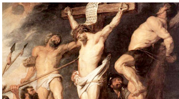
THE CRUCIFIXION [detail] by Peter Paul Rubens (d. 1640)

The following is excerpted from a homily by Pope Benedict XVI on the Solemnity of Christ the King, 21 Nov 2010.