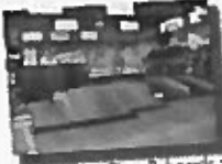
Vashon Indoor Skate Park needs a long-term sustainable plan.

Take advantage of this opportunity to contribute value to Vashon's recreational options and attend the meeting—Monday, January 29 at 7pm, Ober Park. Call 463-9602 for additional information.