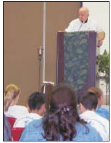
Bishop Pfeifer addressing the youth.