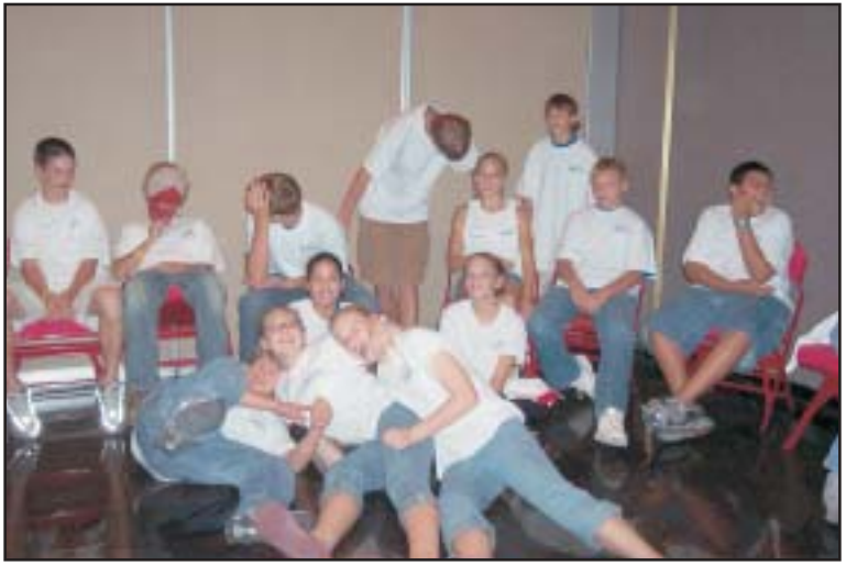
Youth on floor horseing around.