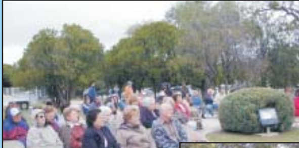
(Above) Worshipers listen to homily during Mass.